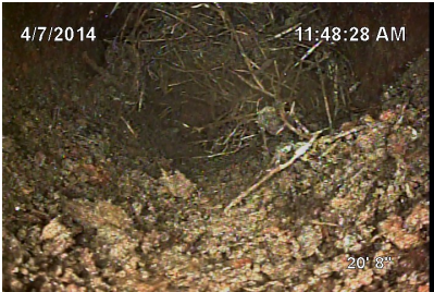
4/7/2014 11:48:28 AM Root intrusion and possible collapsed pipe