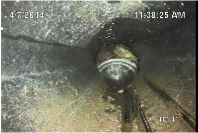
4/7/2014 11:38:25 AM Sewer line not connected at guest house