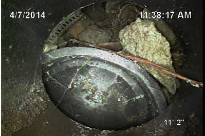
4/7/2014 11:38:17 AM Sewer line not connected at guest house