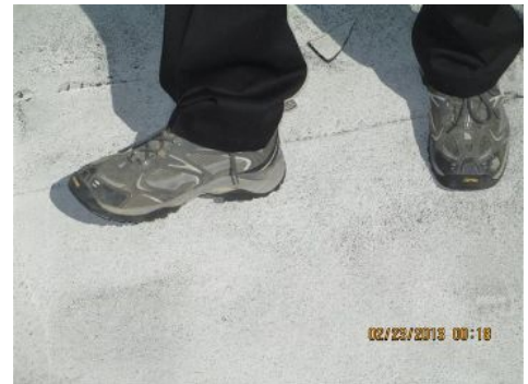
spongy area observed in flat roof covering material