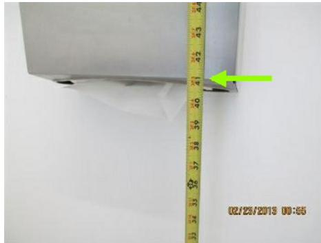
paper towel dispenser is too high