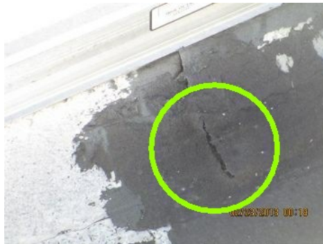
loose materials observed here / sealant is suggested here