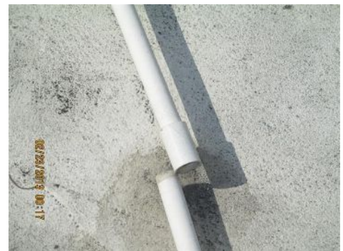
disconnected condensate drain piping