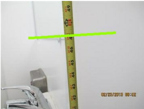
mirror is too high

4.1. The fixtures installed in this unisex restroom do not comply with ADA standards.