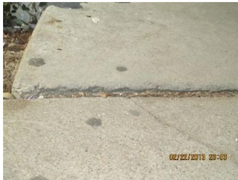
side walk has raised surface

2.2. The sidewalk material was raised and may pose a possible tripping hazard. Caution is recommended in this area.