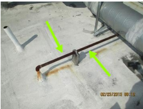
fuel piping is rusted suggested to be painted

3.1. The rusted fuel lines on the roof are suggested to be painted for protection.