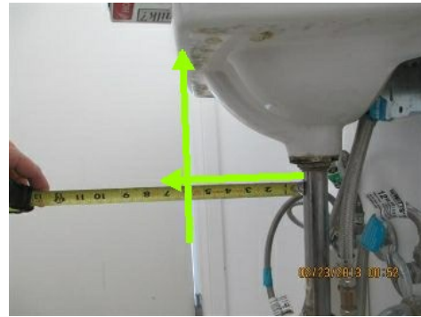
clearances of lav not met here