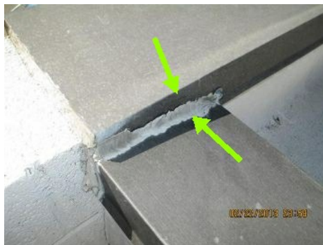
sealant suggested at the parapet wall cap

4.5. We observed grout which was missing in the tile decking material. We suggest replacing this material as a preventative measure.