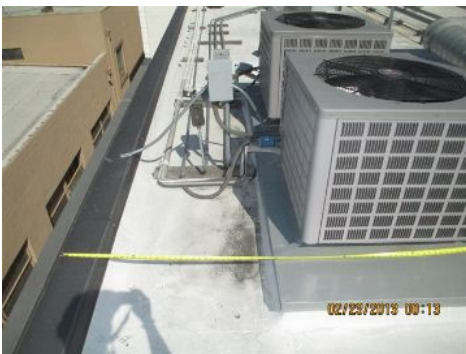
1013.5 Mechanical equipment. Guards shall be provided...

1.1. In accordance to current building standard, the mechanical components on the roof are suggested to possess railing / barriers within the current building standard setback to any / all mechanical equipment located on the roof deck.