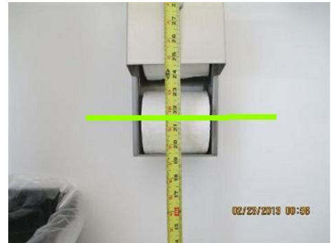
toilet paper roll too high