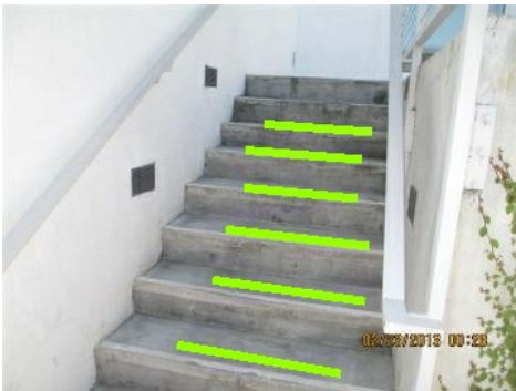
steps suggested to possess non slip tread tape

9.2. The steps located at the front of the structure were damaged and are in need of repair as a safety preventative issue. We recommend the further review, advice and services of a masonry contractor.