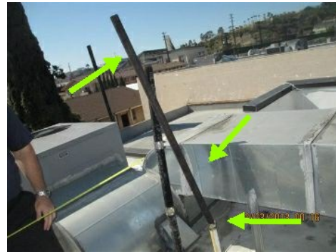
damaged and loose DWV piping