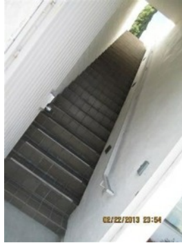
flight of stairs without landing

7.2. The stairs present were in generally good condition. We did, however, note that the treads are suggested to possess non skid tread material and the vertical rise of the flight of stairs is greater than 12 feet, which according to current code, is excessive without a landing.