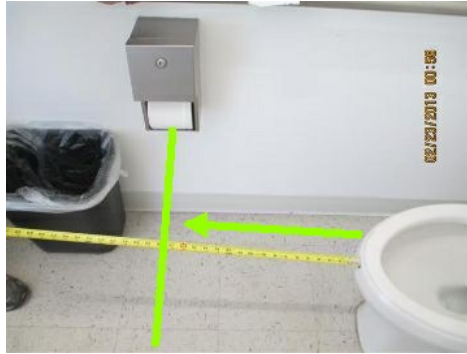
toilet paper roll holder to far from toilet