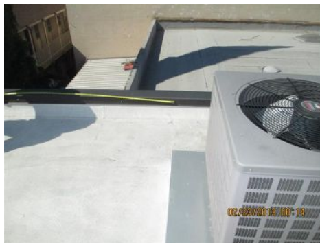
1013.5 Mechanical equipment. Guards shall be provided...