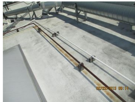
rusted fuel piping observed