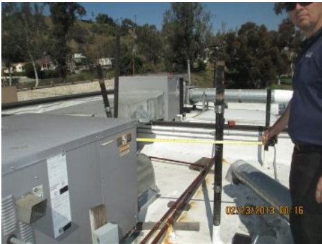
DWV too short in close proximity to package HVAC unit

3.1. We observed DWV vent stacks at the roof level which were damaged and in some cases, too short within the listed proximity to the mechanical package forced air units.