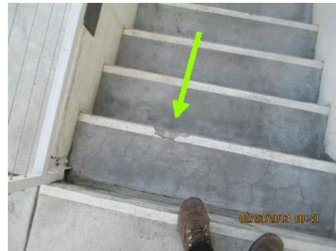
damaged was observed at the front patio / concrete steps