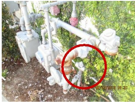
fuel meter was terminated