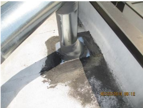
flat roof penetration from ductwork

2.4. There are open seams, or splits, in the mineral cap sheet of the parapet walls that should be sealed before the close of escrow, to forestall any possibility of moisture intrusion.