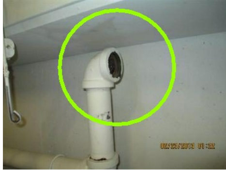
drain or vent piping located in the low level locker missing cover

2.1. The DWV piping located in the lower level cage is missing a clean out cover.