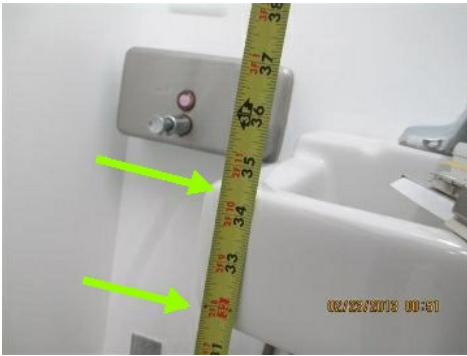
29 / 34 inch clearances are not met here