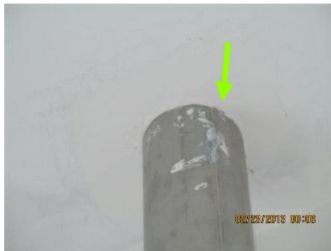
vent too close to combustibles

1.1. The vent pipe of the gas water heater is too close to combustible material (wood, drywall, ductwork & insulation), and should be serviced. A singlewalled vent pipe should be six inches away from any combustible material, and a doublewalled vent pipe (and transite) should be one inch away.