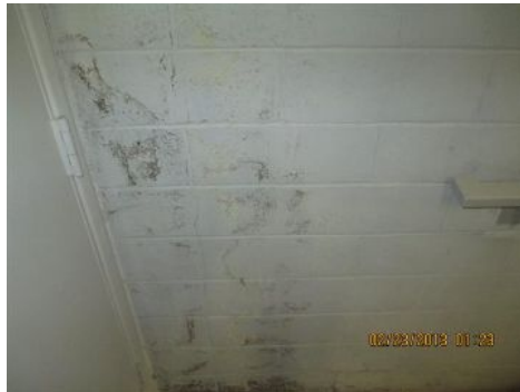
cracking was observed in the lower level hallway north block

1.1. Cracks were observed in the lower hallway north block. Such cracks may be a result of the curing process, seismic activity, ordinary settling, or the presence of expansive soils. We can elaborate, but you may wish to have a structural engineer confirm this.